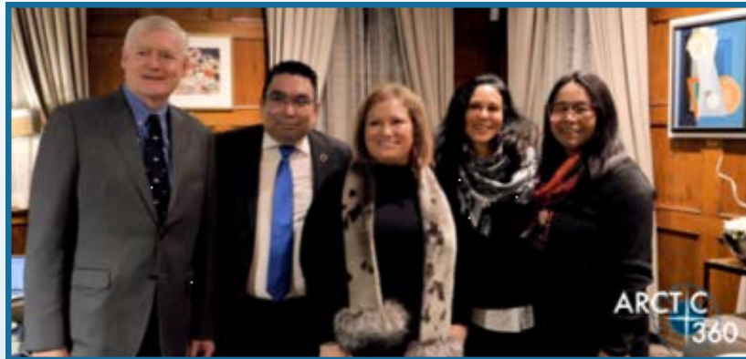
Arctic360 2020 Annual Conference Fireside Chat Dinner, left to right:

C-Level Institutional Investors, Political Leaders, Arctic Indigenous Corporations, C-Level Northern Mining Companies, Tech Executives