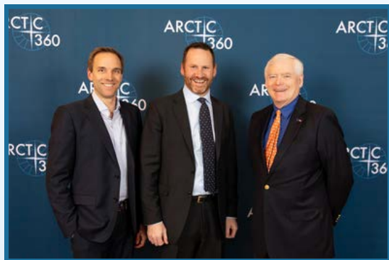
Arctic360 2025 Annual Conference, left to right:

C-Level Institutional Investors, Political Leaders, Arctic Indigenous Corporations, C-Level Northern Mining Companies, Tech Executives