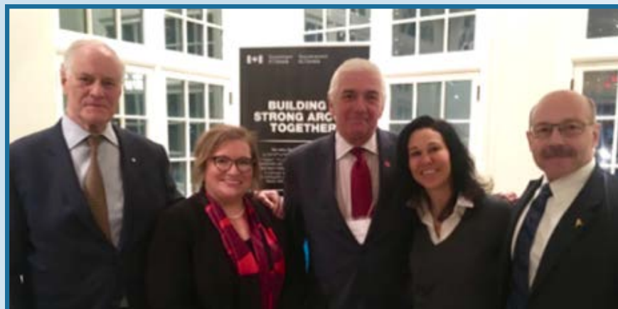
Arctic360 2018 Annual Conference reception, left to right: