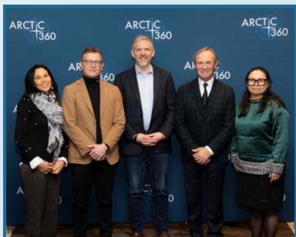
Arctic360 2024 Annual Conference, left to right: