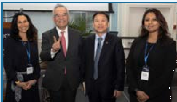
Arctic360 2022 Annual Conference Fireside Chat Dinner, left to right: